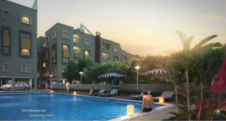
Your refreshing zone Swimming Pool